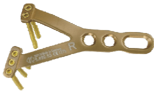
Picture: Radial plate dorsal, right, titanium

In shank: 3 shank holes for cortical screws D 3,5 mm