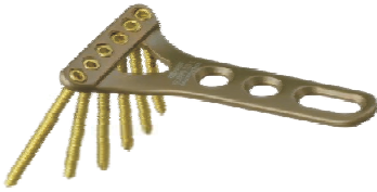
Picture: Radial plate palmar, right, titanium